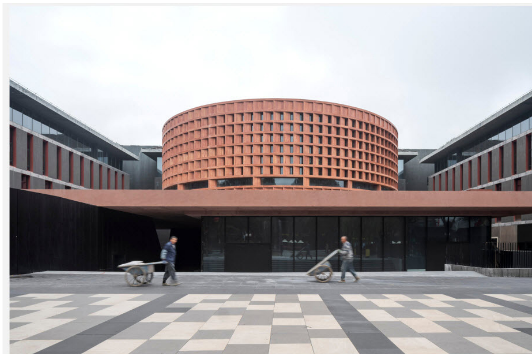
The entrance to the subterranean Qujiang Museum of Fine Arts

For the subterranean Qujiang Museum of Fine Arts, Neri & Hu have created an entrance structure of red natural stone whose striking shape conceals a rather complex suite of spaces.